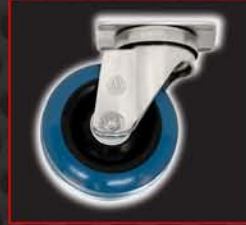
4 INCH POLYURETHANE CASTER, SWIVEL RH-9000.2-BLUE-SS