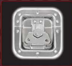
MEDIUM RECESSED LATCH RH-A3020-SS

Our Road Case Hardware will not tarnish, oxidize, discolor, peel or crack and is extremely resistant to sunlight, saltwater and humidity. Spring Loaded Recessed Handles are Mill Finish while all other items are a bright, mirror finish. All are designed and manufactured to last a lifetime.