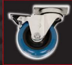
4 INCH POLYURETHANE CASTER, SWIVEL W/BRAKE RH-9000.2-BLUE-SS-BRAKE