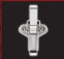
SPRING LOADED DRAWBOLT/LATCH RH-4452-SS