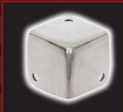
MEDIUM FLAT FLAT CORNER RH-1570-SS