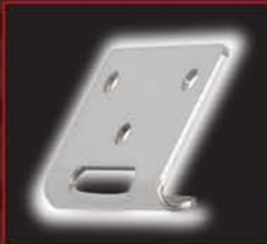
LARGE KEEPER RH-0371-SS