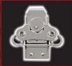
LARGE SPRING-LOADED TWIST LATCH RH-2636-SS