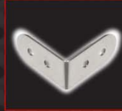
4-HOLE CLAMP, ZINC RH-0610-SS