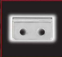
MEDIUM KEEPER RH-2393-SS