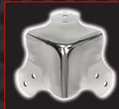
LARGE FLAT CORNER RH-1473-SS