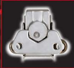
MEDIUM TWIST LATCH RH-2392-SS