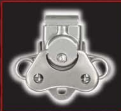
SMALL TWIST LATCH RH-2201-SS