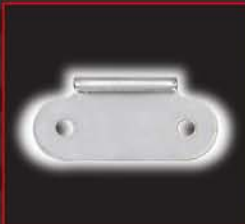
SMALL KEEPER RH-2327-SS