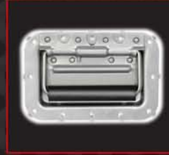
MEDIUM RECESSED HANDLE, 10 HOLE RH-0511-SS