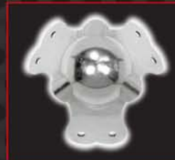
LARGE BALL CORNER, 14 GA. RH-1502-SS