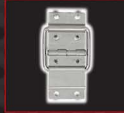
LARGE STOP HINGE RH-1858-SS