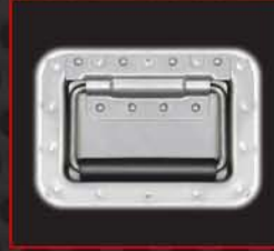
LARGE RECESSED HANDLE RH-0520-SS