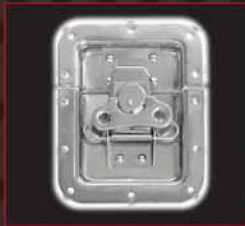
LARGE RECESSED LATCH RH-A3004-SS