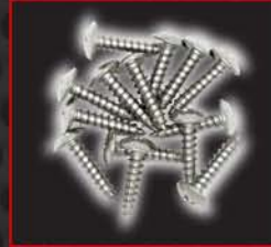
WOOD SCREW, 1/2" OR 3/4" ZINC RH-5112-SS or RH-5134-SS